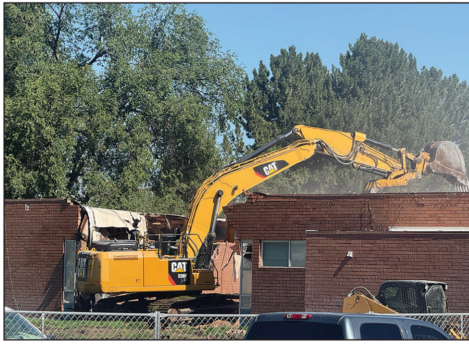
Demolition began on the south side area of the HRDC building August 12.

The main construction work is expected to take about 60 days, with landscaping to be completed in the spring to restore the site. Anyone with questions about the project can contact Construction Management Services at the Executive Office.