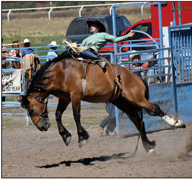
Blossom Rodeo Company saddle bronc horse skies as rider completes an eight second ride.