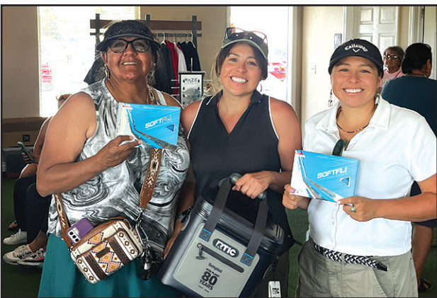
Goofy Google drive winners