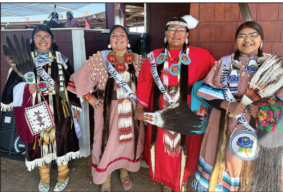
2025-26 Miss Sho-Ban contestants await the coronation ceremony.