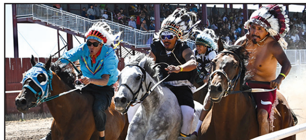
Chief Race riders at the start on Friday, August 8.