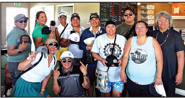
Women's golf Croque Putt Winners.