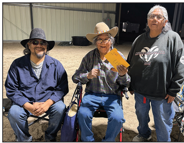
Elder Tourney: First place Farrell Wildcat Sr. team.