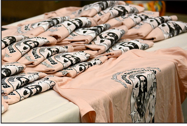
Above: T-shirts handed out to participants feature design of LeGrand Coquin artwork Wandell Wenee created.