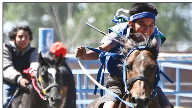
Birdinground rider wins the Youth Straight race on August 8.