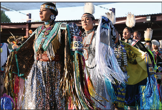
Women's Fancy Shawl dancers on August 8.

Women's Back-up Singing Contest, first place Wild Rose; second place, Bad Eagle; third place; Southern Style; and fourth place, Scout Society. Consolation winners included Ozuye, Bull Horn, Hillcreek, and The Braves.