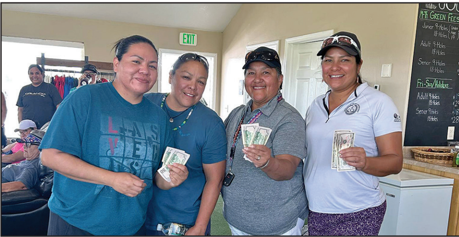
Women's Golf first place team.