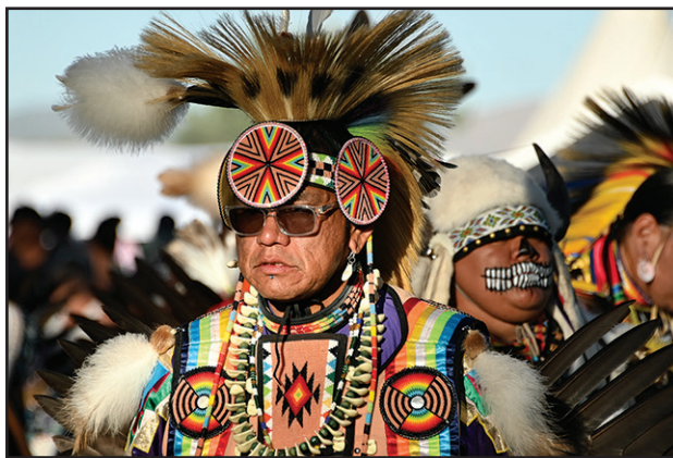
Sr. Men's Traditional dancer on August 9.