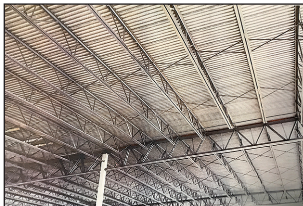
Progress on the roof.

The vault shell that houses the count room is complete with a steel ceiling over it. It will require special identification to gain access in and out of