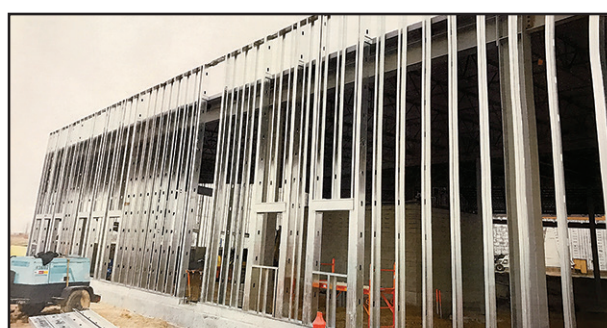
Steel wall construction.

the room, once the building is complete.